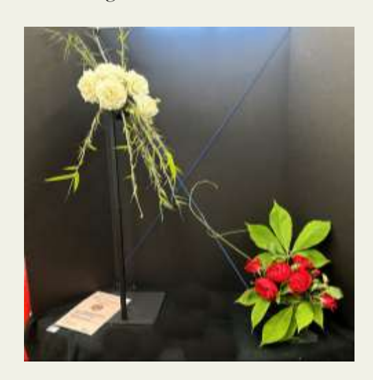
Enblazen the Police and Fire (Modern) Patsy Cunningham Police: The Thin Blue Line