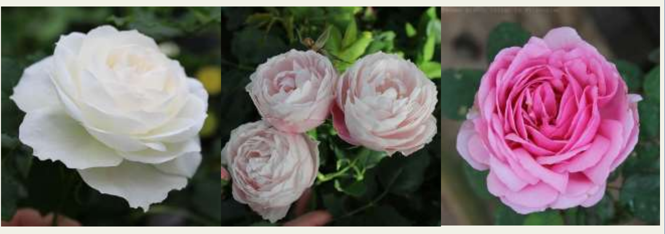
Boule De Neige

Today we focus on the Bourbon rose. These roses were first found on the Isle of Bourbon in the Indian Ocean, just east of Madagascar. Bourbon roses are crosses between the fragrant Damask rose and the reblooming China rose. They feature large, heavily fragrant blooms that come a variety of colors. They are very vigorous and are often grown as large shrubs. Bourbon roses are typically cold hardy, surviving zone 4 winters. Although they can be victim to blackspot and mildew, their strong vigor means that their growth is rarely hindered. Additionally, most Bourbon roses will rebloom, unlike some other OGRs. They make a beautiful contribution to any rose garden.