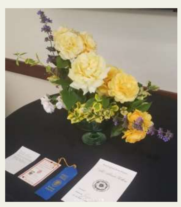
All About Yellow Jacqui Nye