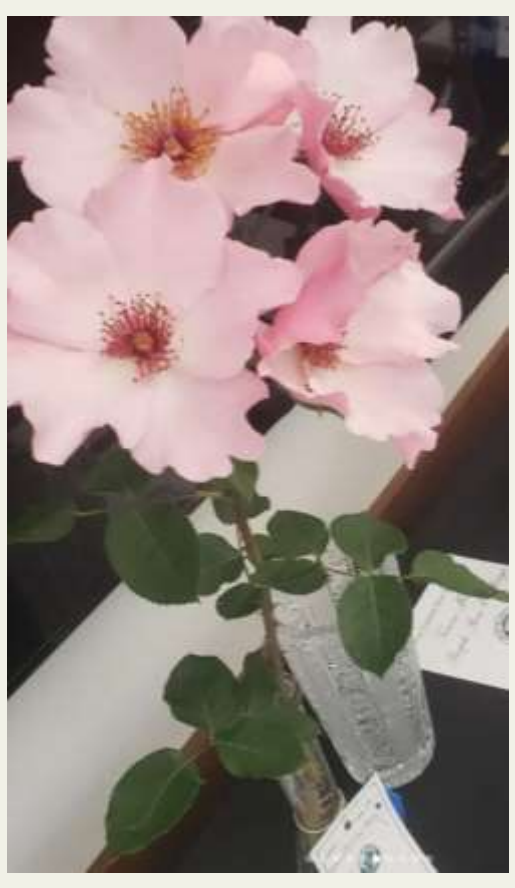
Hybrid Tea/Grandiflora Spray Dainty Bess