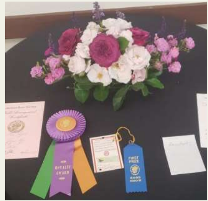
The Color Purple Jacqui Nye