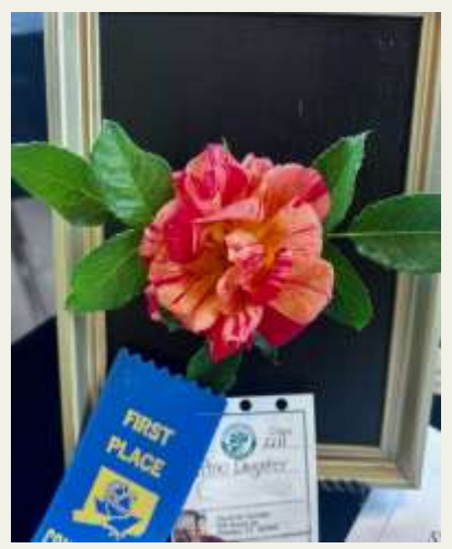
Small Rose in Picture Frame Tattooed Daughter David Candler