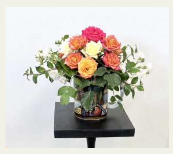
Praise for Teachers (Traditional Mini) Jacqui Nye