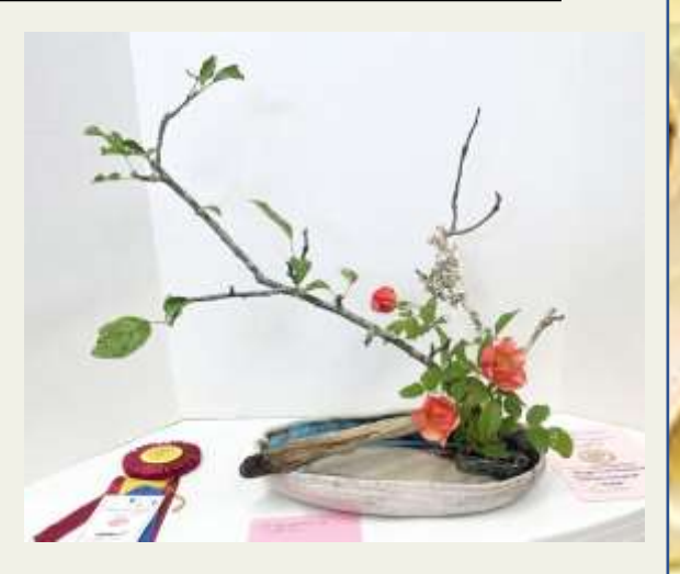
Applaud the Medical (East Asian) Patsy Cunningham Bridge over Troubled Water